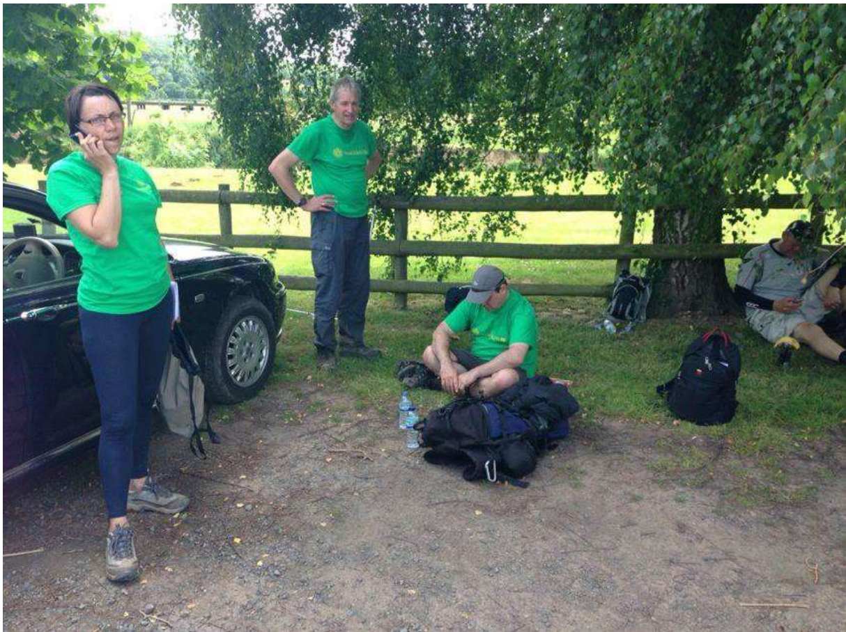
20 miles down: Grateful for the shade, the group contemplates progress and life in general