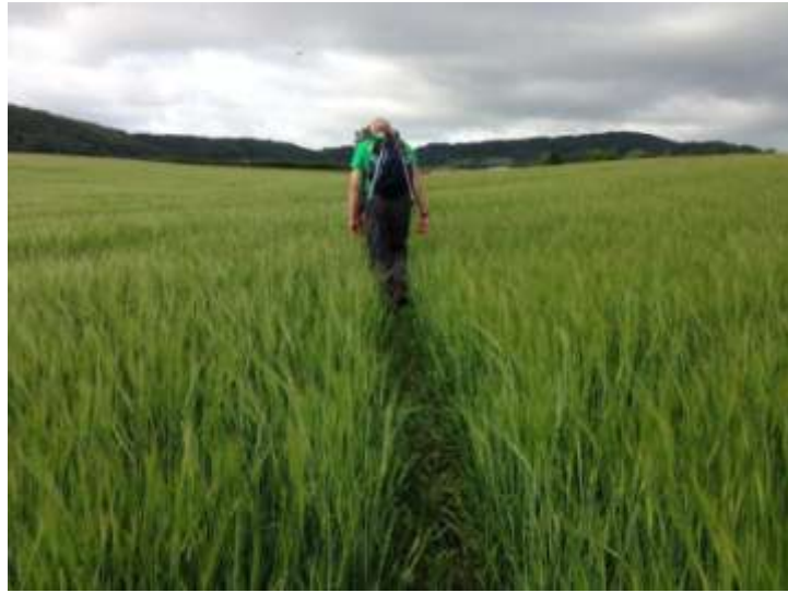
The beautiful wheat fields near Netherton House Farm as the group heads towards Abberley Hill.