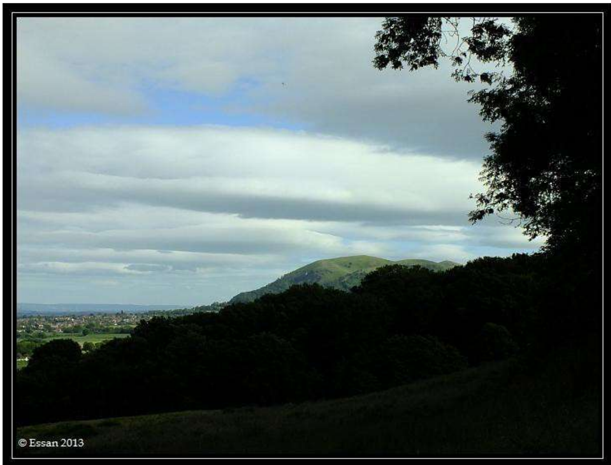
North Hill: But we didn't know at this stage what was still to come

The Malvern Hills were now visible to our left through the trees, tantalisingly close, yet still over 8 miles away.