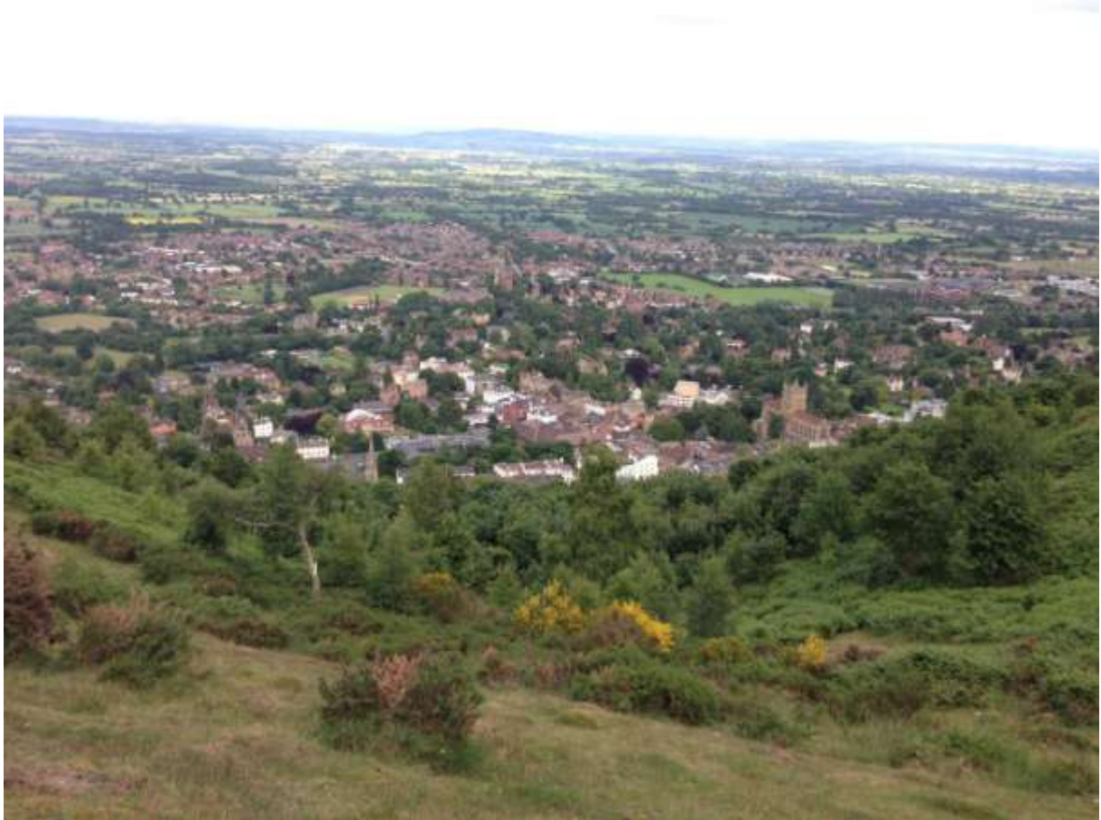
The end is nigh: Great Malvern, from the east slope of North Hill

North Hill. The 3 counties were spread out in beautiful late afternoon sunshine as we picked our way around the path. We were too hot, too tired and too bothered now to care.