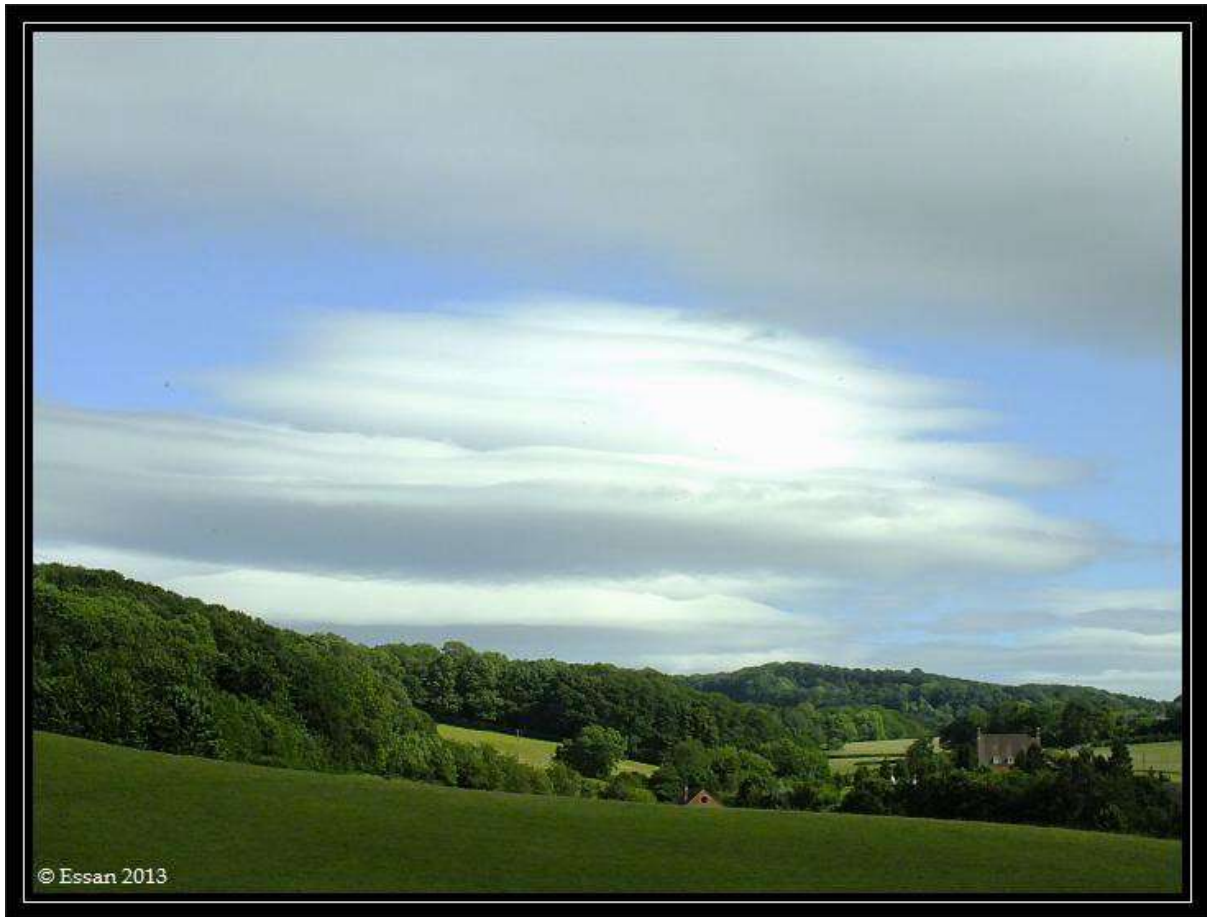
A lovely day for a walk: Lenticular clouds rise over the distant Chilterns buoyed by the warm rising air