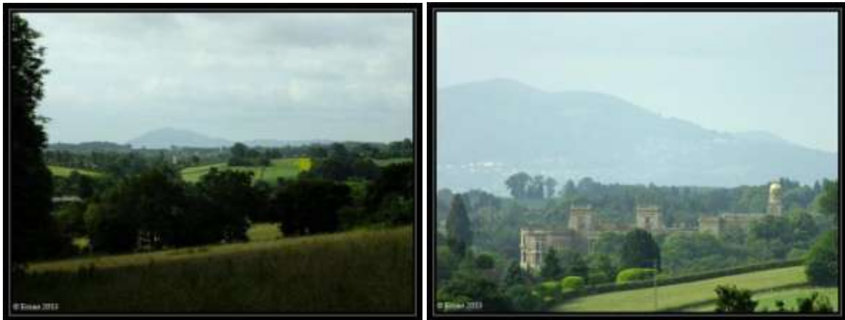
The view from Abberley Hill: Looking south towards Great Malvern

After 3 hours of walking, we finally got our first glimpse of the finishing target way off in the distance. Behind Abberley School rose the spectre of the Malvern Hills.